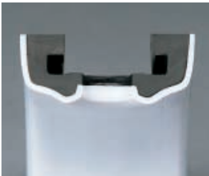
Seat cross-section at stem hole.

BRAY'S UNIQUE SEAT DESIGN is one of the valve's key elements. The elastomer backed PTFE seat features a tongue and groove retention method which holds securely between either slip-on or weld-neck flanges and also allows simple and fast field replacement. This EPDM backing provides resilient support for the molded PTFE, thus maximizing the shut-off and cycle life of the seat.